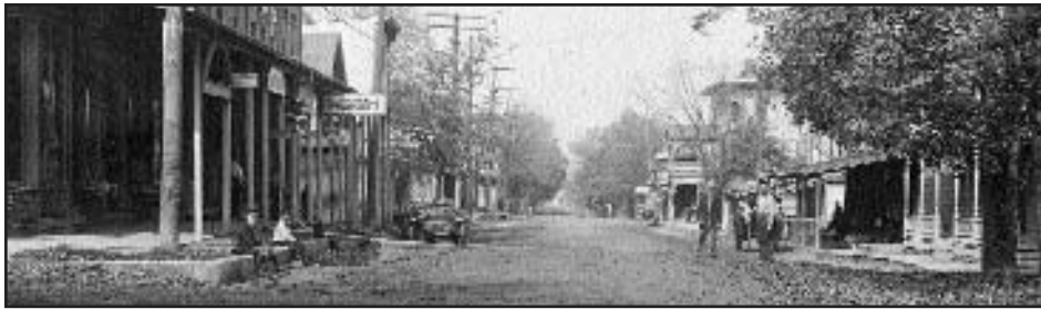
In this undated image, two young boys sit in front of the Main Street storefront that is now the Watershed Network office.