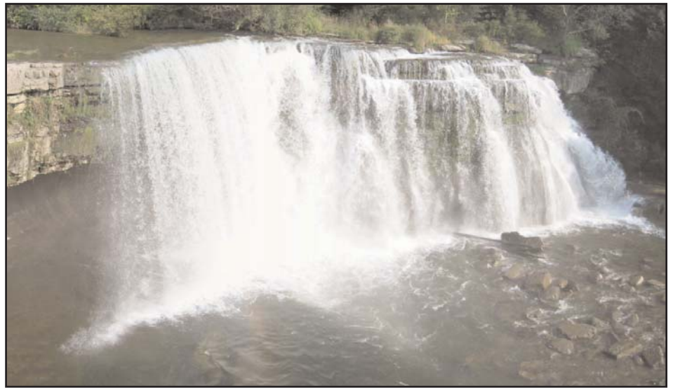
Ludlowville Falls showers over ancient sedimentary rocks

There are two reasons for this situation. The first is obvious as you stand in any of our gorges: there are lots of rocks to look at! To be a bit more technical about it, there is an enormous thickness of flat-lying sedimentary strata beautifully exposed. This is because around 400 million years ago, during the Devonian Period, a mountain range formed to our east due to the collision of what is now North America with what is now western Europe. As this mountain range grew, it also eroded, pouring sand and mud westward into the shallow sea that had flooded much of North America. Today, this sand and mud forms more than 1000 meters (3000 feet) of shale, siltstone, and sandstone – one of the