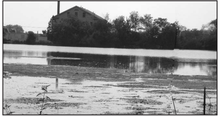
Algae chokes this Union Springs pond