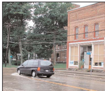
Stormwater rushes past the Watershed Network's office picking up road grime

You can ensure that the stormwater moving across your property carries as few pollutants as possible. Even if your house is not close to a stream or river, the runoff probably flows there quickly via a roadside ditch or storm drain. From there it empties into a stream or lake, taking soil and pollutants along with it. Washing one's car in the driveway can send soap and grease into the