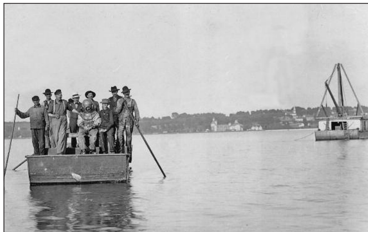
Cayuga Lake has been a source of fascination and fun for a long time. This old photo shows a diver and smiling crew offshore of the Village of Cayuga near the north end of the lake. Wonder what they have in mind, in such shallow water?

These are among the main contributors to the water quality challenges facing our beautiful Cayuga Lake – and they are all solvable. If we can educate residents and visitors, and get them to understand that they can be part of the solution by changing their behavior and making different choices, we and our descendants could enjoy a long-term sustainable situation across the Cayuga Lake watershed. 🐦