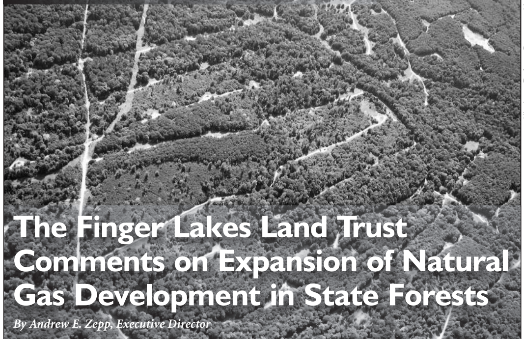
Allegheny Defense Project and Lighthawk